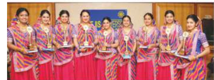
The Ballerinas of the IIS University, hit a home run with their excellent performance in the Inter-Collegiate Dance Competition at Maharaja College.