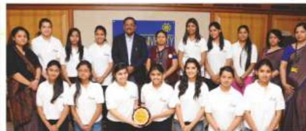
The IIS Yuva Chaupal, attained a special recognition in their Annual General Meet organized at Holiday Inn, Jaipur, for their round-the-year bustling activities.